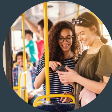
Convenient & Accessible Transportation