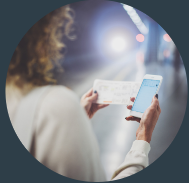
Intelligent & Innovative City