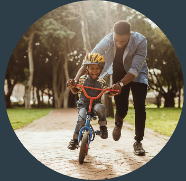
Healthy, Safe & Livable Community