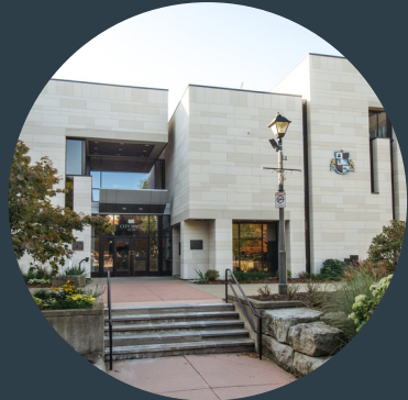
Responsible & Transparent Financial Management