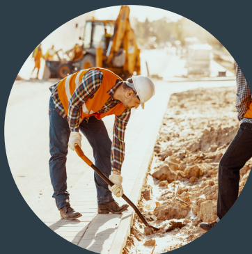
Strong & Resilient Infrastructure