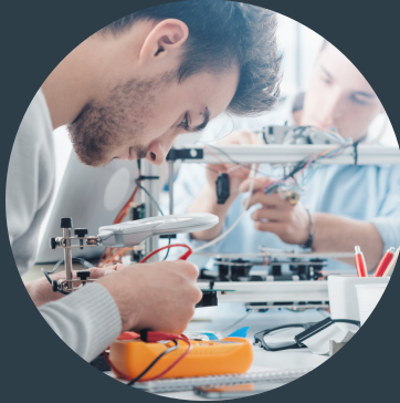
Vibrant & Diverse Economy