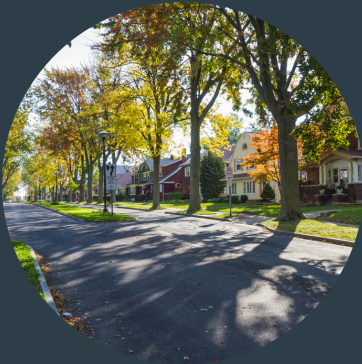
Diverse & Affordable Housing