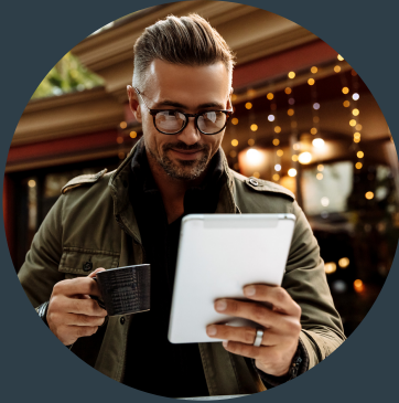
Engaging & Accountable Government